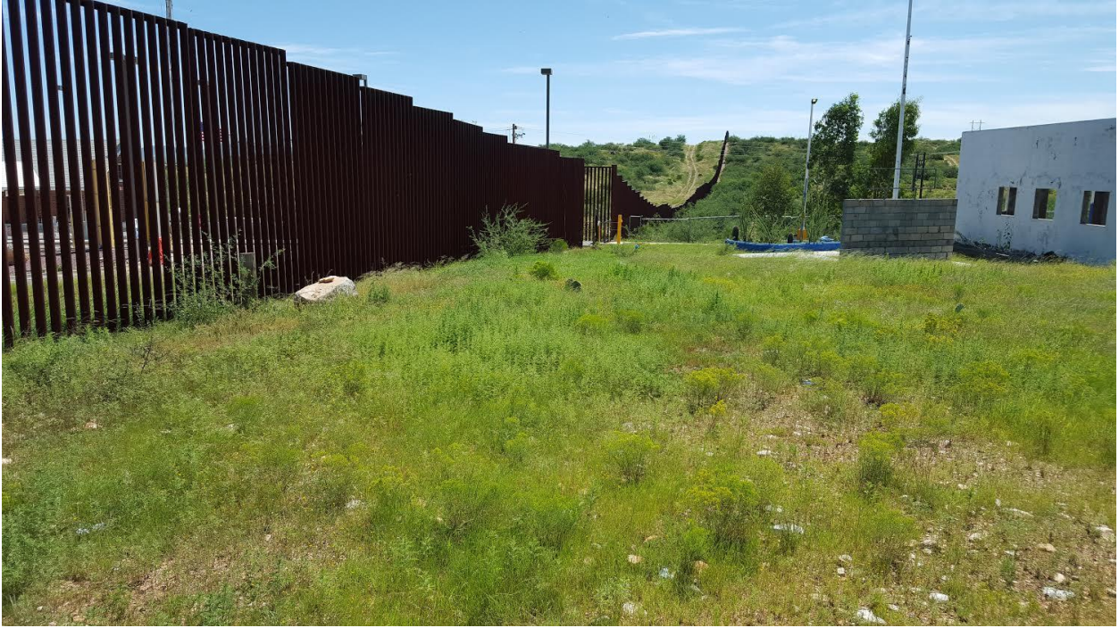
United States Border Fence Dividing Sasabe, Arizona and Sasabe, Sonora from the Mexican Side, at the headquarters of Mexican relief agency Grupos Beta