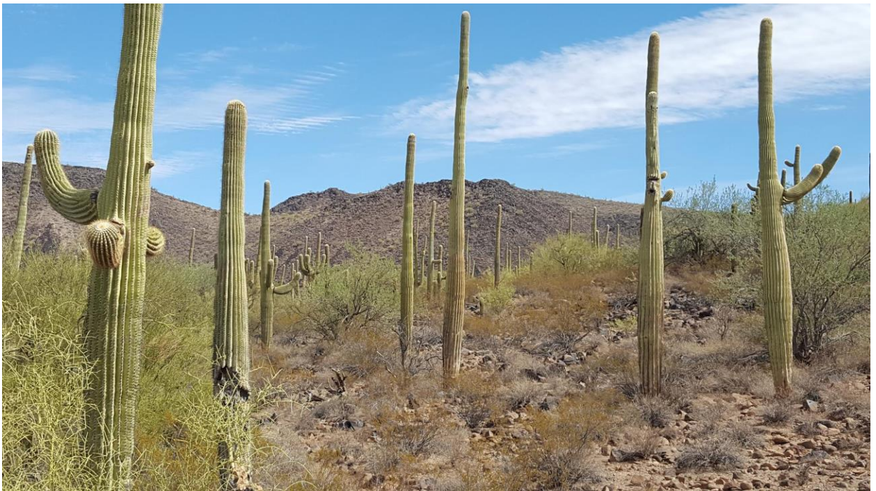
Desert Terrain in the Growler Mountain Valley

Last year, Humane Borders added water stations in the west desert, with several new stations in the Organ Pipe Cactus National Monument. These include our first mobile water station in the Growler Mountain Valley, a 55-gallon barrel that we stock with gallon jugs filled with water and then cover so that ravens don't peck holes in the jugs and drink the water themselves. The mobile station has been particularly successful, with lots of water use by migrants traversing this almost impossibly forbidding terrain. We also added a water station in the remote Cabeza Prieta National Wildlife Refuge and maintained our flagging at water sources there.