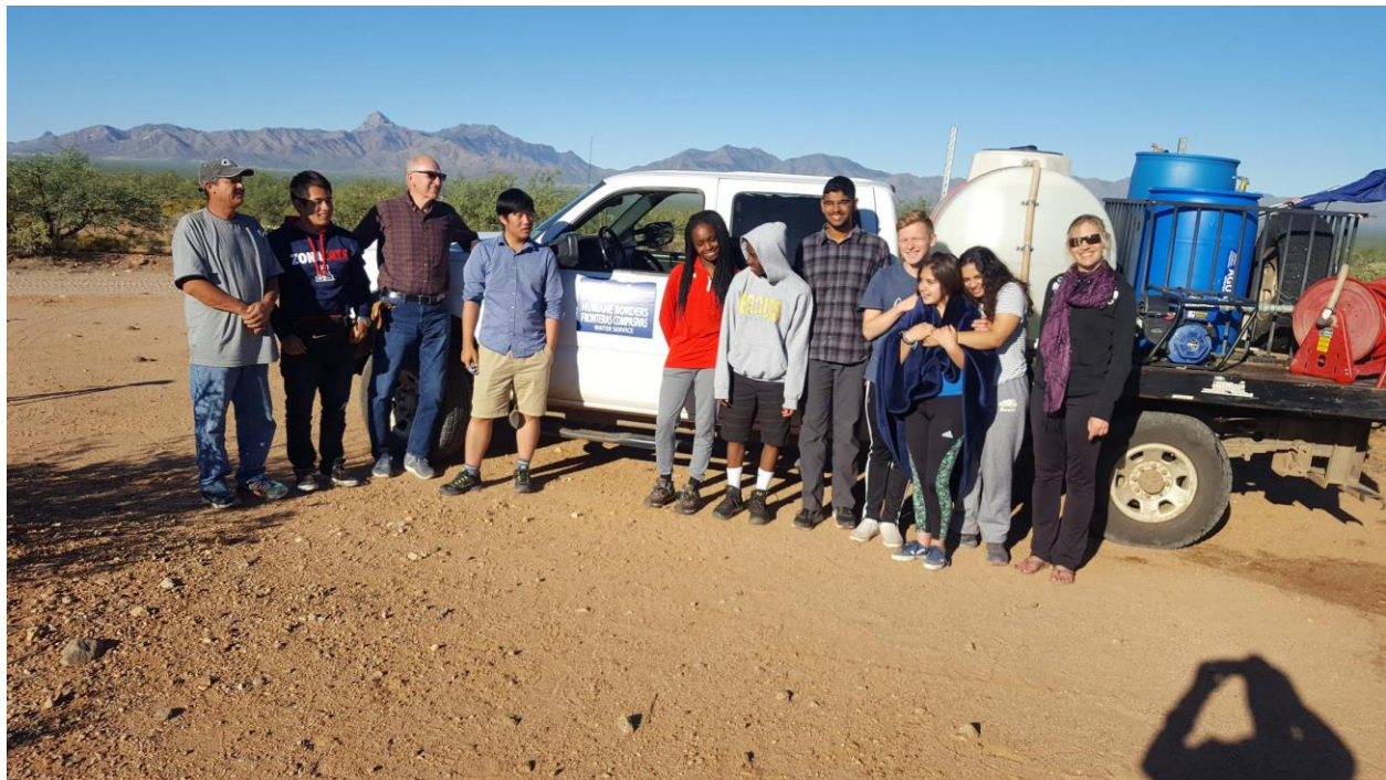
United World College Students, at the Humane Borders Bishop Minerva Carcano Water Station Buenos Aires National Wildlife Refuge Water Run