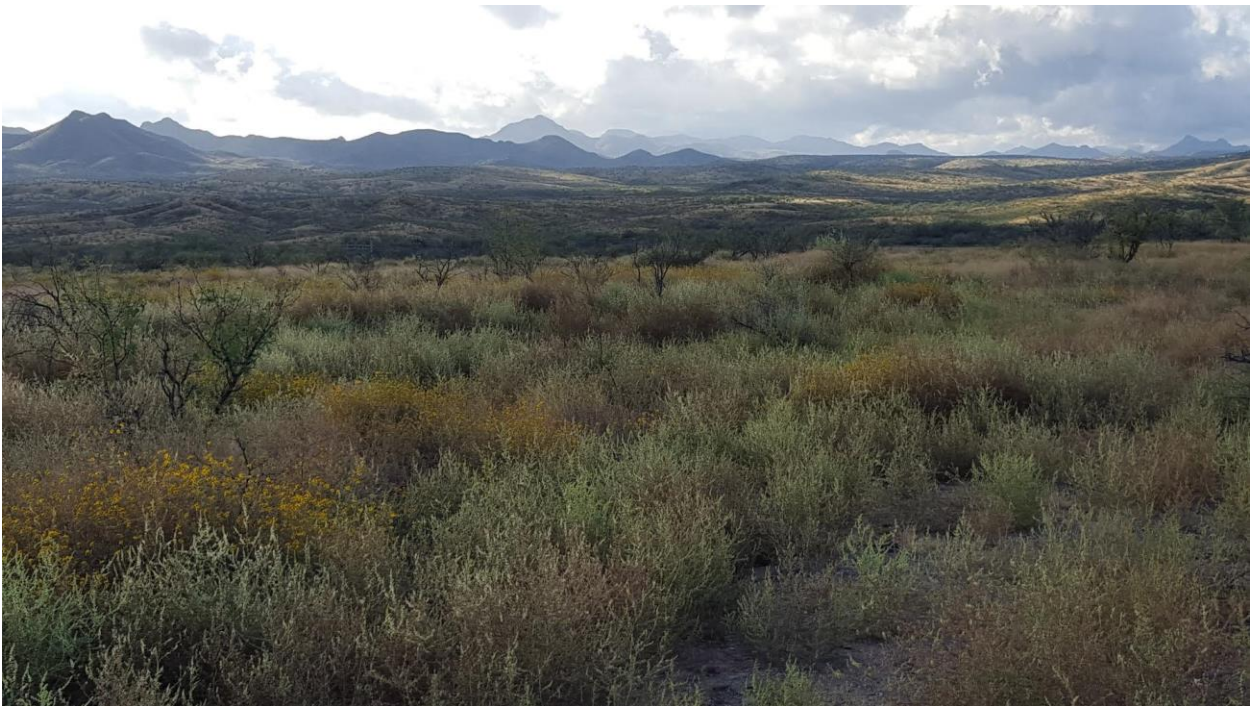
Landscape Near the Humane Borders Rocky Road Water Station Arivaca Water Run, Monsoon Season 2016