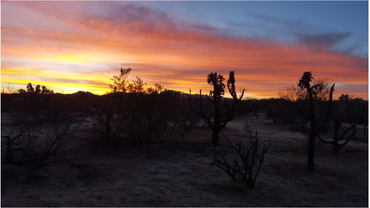
Sunrise Near the Brawley South Humane Borders Water Station, Buenos Aires National Wildlife Refuge Water Run, Winter 2016