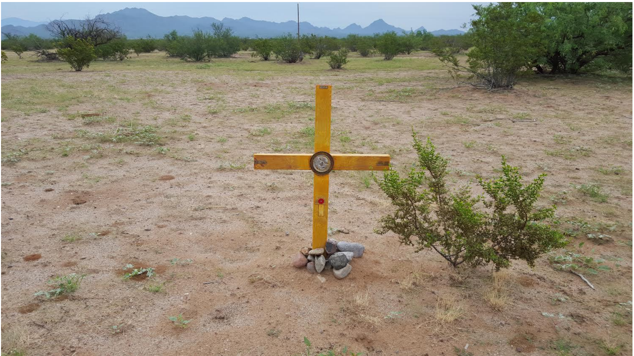
Tucson Samaritans Cross Marking the Place Where a Migrant Died, on the Humane Borders Ironwood Forest National Monument Water Run