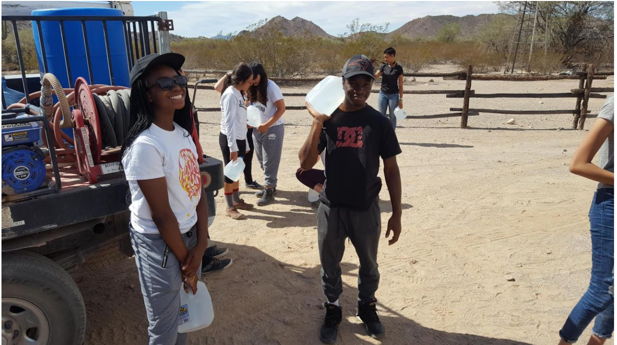
United World College Students Preparing to Carry Water to Mobile Station, Organ Pipe Cactus National Monument