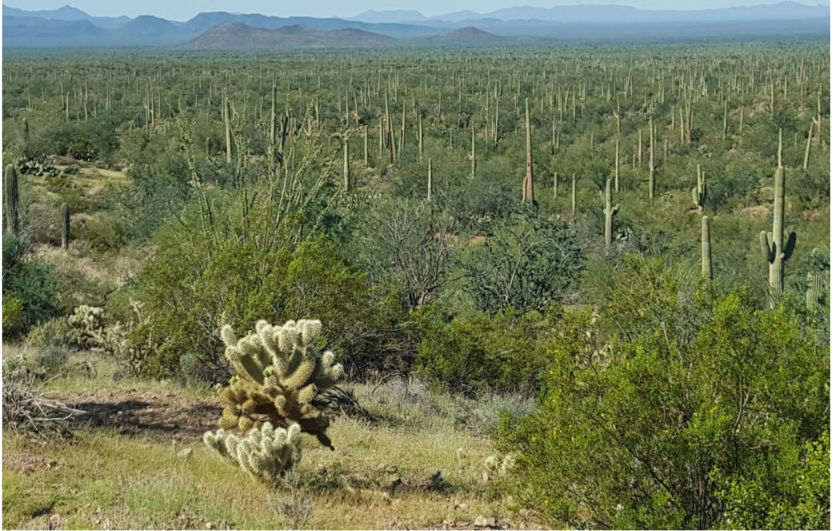
Ironwood Forest National Monument, Humane Borders Water Run

Humane Borders, motivated by faith and the universal need for kindness, seeks to create a humane and just border environment.