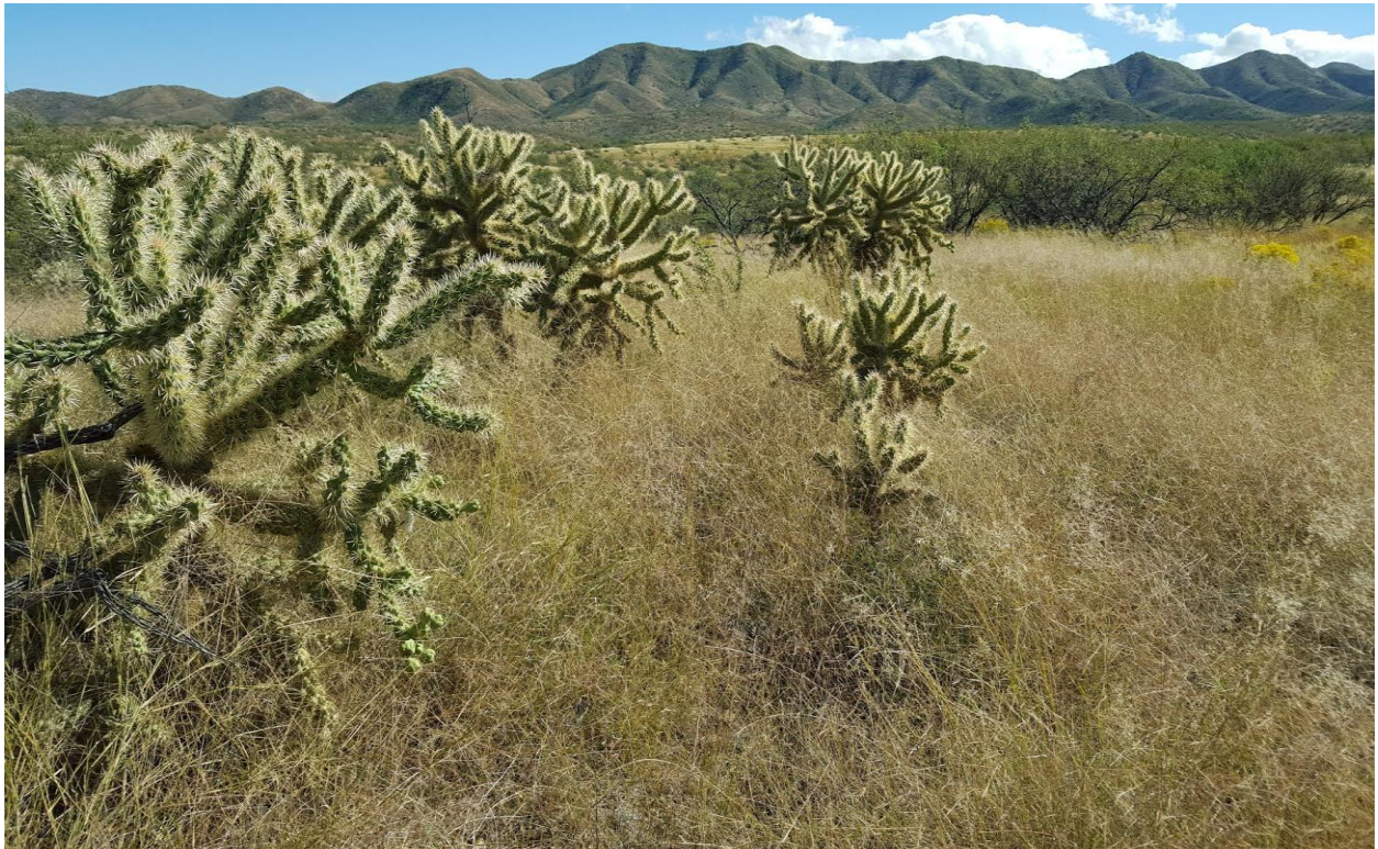
Cholla and Las Guijas Mountains, at the Figuero Humane Borders Water Station, Buenos Aires National Wildlife Refuge Water Run